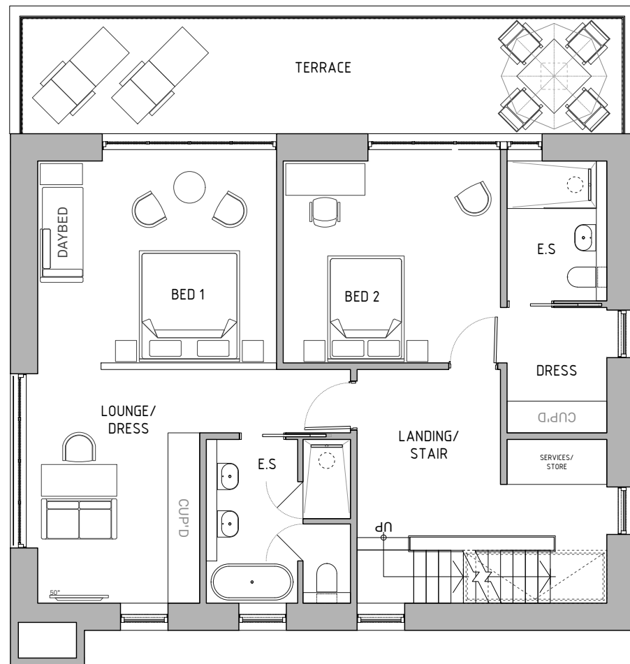
GA SECOND FLOOR